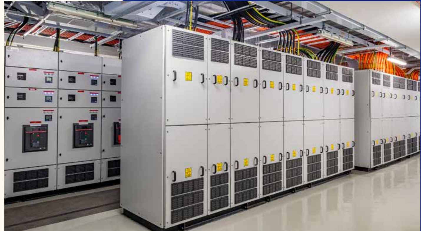
UPS Switchboard at PDG's SGI in Singapore

The batteries in the UPS in data centers are usually used for backup in an outage. However, their large capacity can also be tapped on to store energy generated by renewable sources. In Singapore, PDG is seeking a way to accumulate the energy harvested in the day and delivered over the grid to the data center.