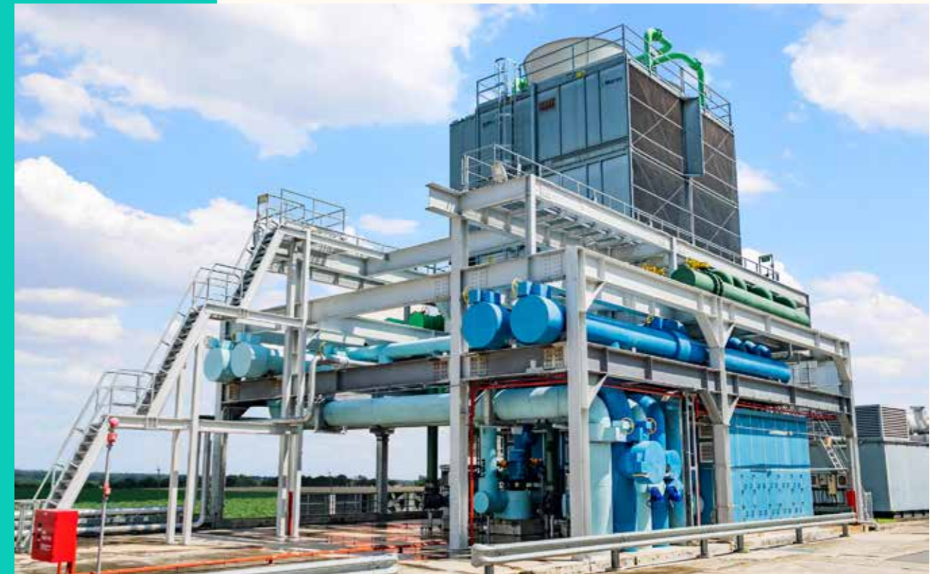
Chillers at PDG's SG1 in Singapore

In 2020, the Singapore site carried out an overhaul of our existing HVAC systems. This included reprogramming our SMARTD chillers to boost efficiency, making changes to the cooling configuration and adding optimizations to the air supply and fan speed. Condenser water supply was also adjusted. In all PDG has invested over US$1.6 million in upgrading SG1.