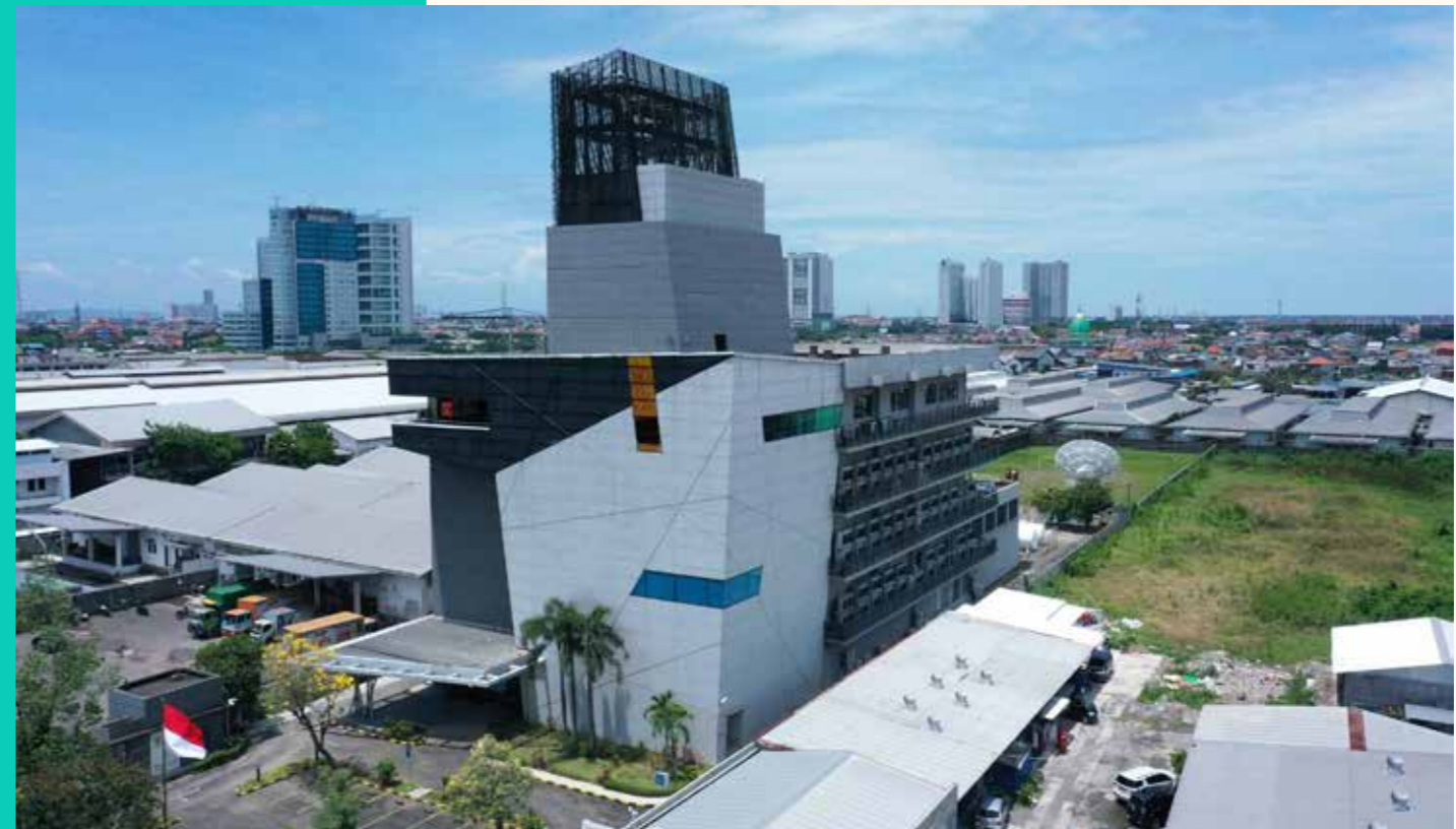
PDG's JB1 Data Center in Jakarta, Bintaro

Indonesia's state electricity corporation, PLN, has a certification in place to enable organizations to use renewable energy in the country. The Renewable Energy Certificate (REC) is a market-based instrument that states that a certificate holder uses one MWh of electricity generated from renewable energy sources.