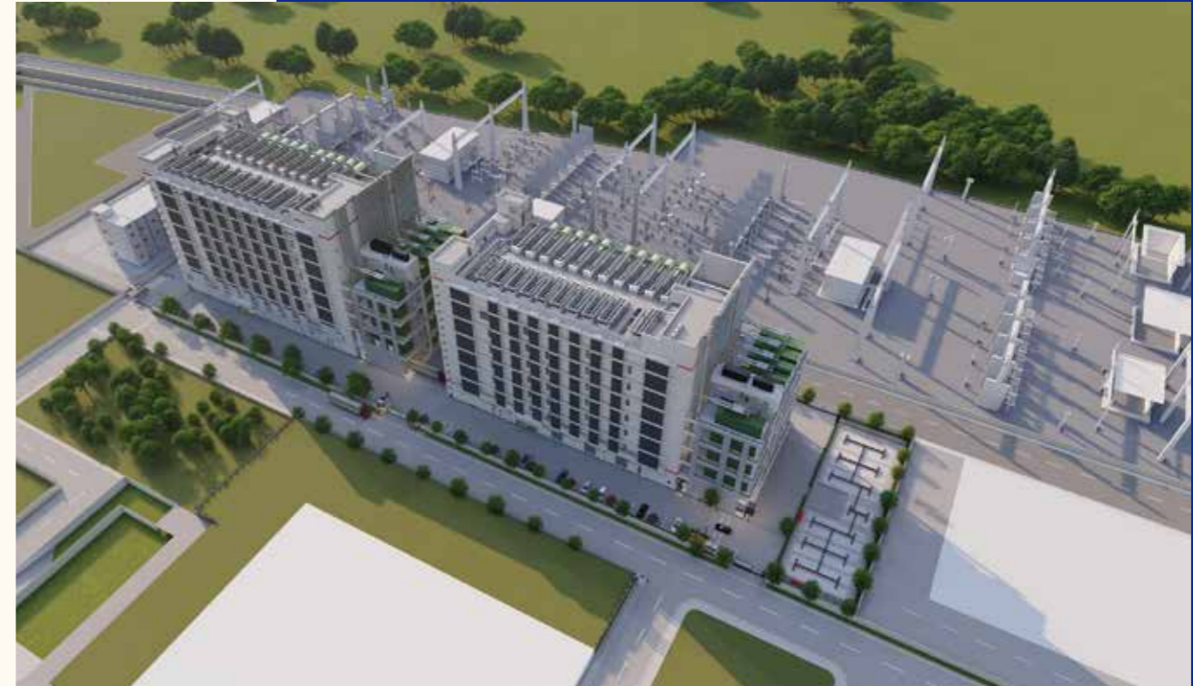
PDG's MUI Data Center in Mumbai

Besides making use of medium voltage (MV) diesel generators, the deployment of modular UPS systems and a closed-loop water system, our efforts at using energy efficiently in India also include raising the operating temperature so there is a lighter load on cooling.